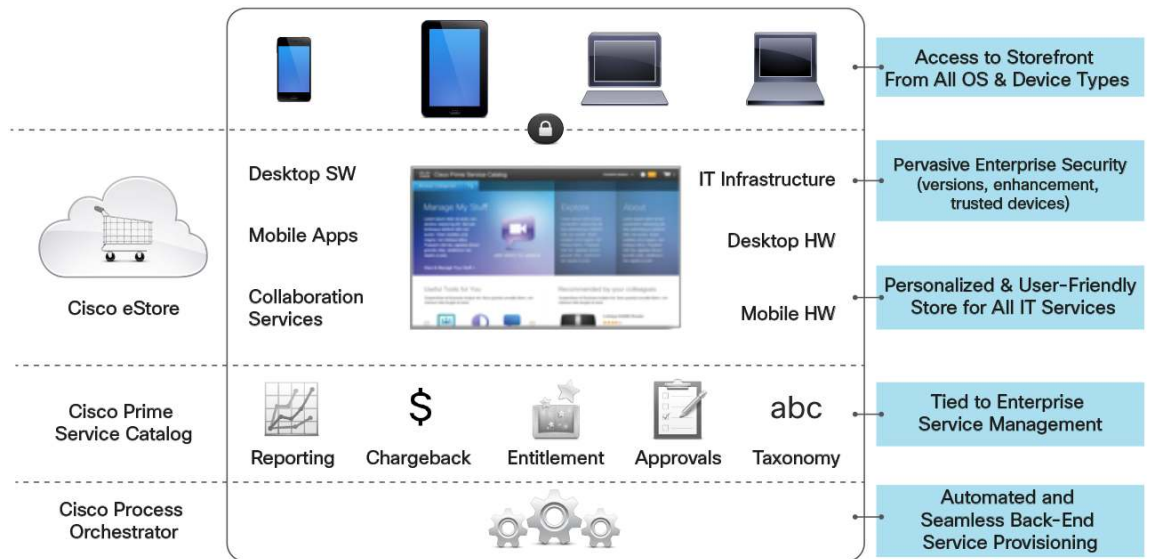
Figure 1. Cisco IT's eStore: Unified, Transparent Way to Order and Deliver Enterprise IT Services

In early 2013, the Cisco IT eStore team successfully launched the eStore through a controlled release and made only a few services orderable from the store. Services orderable through the eStore were for virtual desktops, Cisco OfficeExtend for remote workers, and data center infrastructure services from our private cloud (Cisco IT Elastic Infrastructure Services—CITEIS). The team has since added Cisco Jabber™ for instant messaging, and Cisco Webex® for web conferencing, as well as additional IaaS and PaaS capabilities.