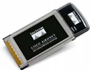
Figure 1. The Cisco Aironet 802.11a/b/g Wireless CardBus Adapter

Whether configured to support single 802.11b coverage, single 802.11g coverage, single 802.11a coverage, dual-mode 802.11a/g coverage, or trimode 802.11a/b/g coverage, the Cisco Aironet 802.11a/b/g Wireless CardBus Adapter is Wi-Fi-compliant and combines the freedom of wireless connectivity with 802.11i/Wi-Fi Protected Access 2 (WPA2) encryption for the performance, security, and manageability that businesses require (Figure 1).