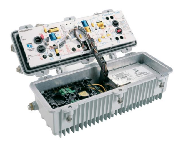
Figure 1. GainMaker High Output Node

The GainMaker High Output Node accommodates a second forward receiver with an RF switch to provide forward path optical redundancy. Reverse traffic can be combined and routed to distributed feedback (DFB), coarse wavelength-division multiplexing (CWDM), dense wavelength-division multiplexing (DWDM), or Enhanced Digital Reverse (EDR) transmitters. The High Gain Balanced Triple (HGBT) launch amplifier module provides three high-level outputs. Additionally, the node is available with an optional DOCSIS status monitoring transponder. On-board temperature, automatic gain control (AGC) levels, RF switch position, power supply condition, as well as other features and parameters can be monitored through this transponder.