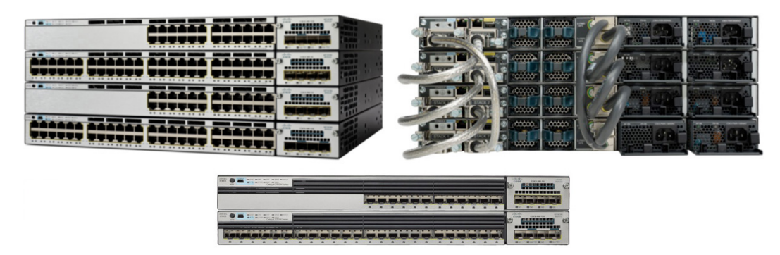
Figure 1. Cisco Catalyst 3750-X Series Switches (Front and Back)

Figure 1 shows the Cisco Catalyst 3750-X Series Switches (front and back).