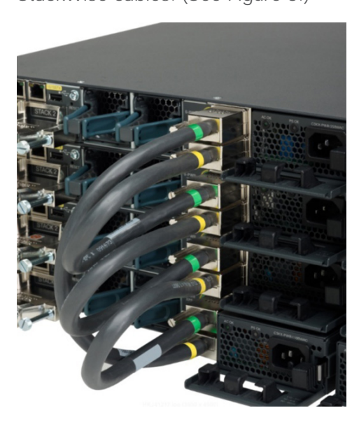
Figure 3. StackPower Connector

The Cisco Catalyst 3750-X Series introduces Cisco StackPower technology, innovative power interconnect system that allows the power supplies in a stack to be shared as a common resource among all the switches. Cisco StackPower unifies the individual power supplies installed in the switches and creates a pool of power, directing that power where it is needed. This feature is available in all Cisco Catalyst 3750-X Series Switches feature sets*. Up to four switches can be configured in a StackPower stack with the special connector at the back of the switch using the StackPower cable**, which is different than the StackWise cables. (See Figure 3.)