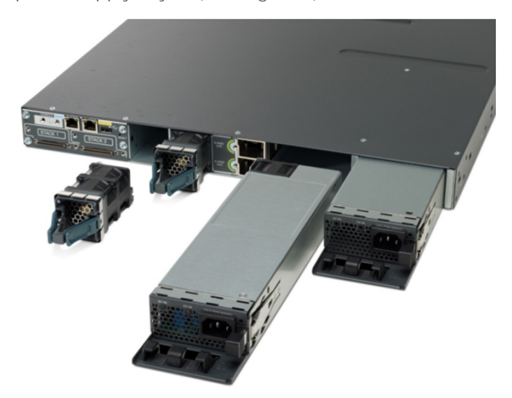
Figure 5. Dual Redundant Power Supplies

The Cisco Catalyst 3750-X Series and 3560-X Series Switches support dual redundant power supplies. The switch ships with one power supply by default, and the second power supply can be purchased at the time of ordering the switch or at a later time. If only one power supply is installed, it should always be in the power supply bay 1. (See Figure 5).