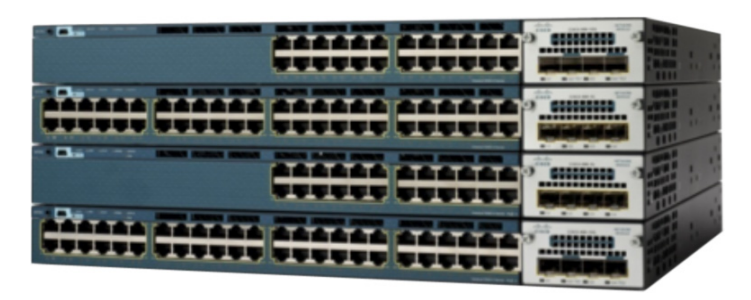
Figure 2. Cisco Catalyst 3560-X Series Switches

Figure 2 shows Cisco Catalyst 3560-X Series Switches.