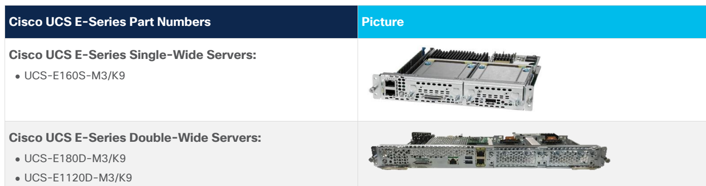
Table 1. Cisco UCS E-Series Servers

Table 1 lists the top-level part numbers for the E-Series Servers.