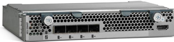
Figure 4. Cisco UCS 2204XP Fabric Extender

The Cisco UCS 2204XP Fabric Extender (Figure 4) has four 10 Gigabit Ethernet, FCoE-capable, SFP+ ports that connect the blade chassis to the fabric interconnect. Each Cisco UCS 2204XP has sixteen 10 Gigabit Ethernet ports connected through the midplane to each half-width slot in the chassis. Typically configured in pairs for redundancy, two fabric extenders provide up to 80 Gbps of I/O to the chassis.