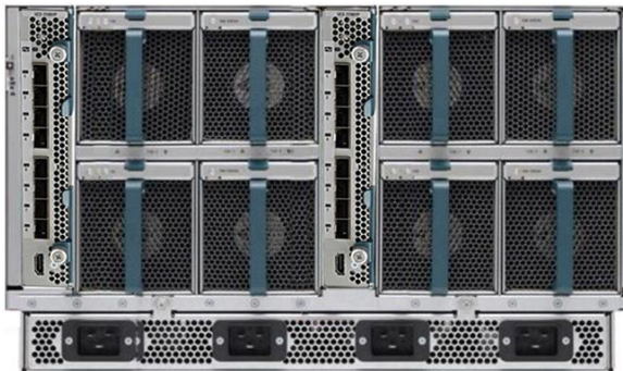
Figure 2. Rear of Cisco UCS 5108 Blade Server Chassis with Two Cisco UCS 2208XP Fabric Extenders Inserted

Cisco UCS 2200 Series Fabric Extenders fit into the back of the Cisco UCS 5100 Series chassis. Each Cisco UCS 5100 Series chassis can support up to two fabric extenders, allowing increased capacity and redundancy (Figure 2).