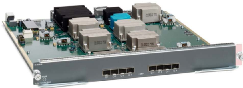
Figure 1. Cisco MDS 9000 10-Gbps 8-Port FCoE Module

Enterprise networks are growing rapidly, and data centers are struggling to manage power, cooling, and space. In response, enterprises are looking for ways to extend the life of existing data centers to get the most from their investments for years to come. The Cisco MDS 9000 10-Gbps 8-Port FCoE Module bridges the gap between the traditional Fibre Channel SAN and the evolution to FCoE. Enterprises can reduce capital expenditures (CapEx) and operating expenses (OpEx) in the data center by deploying FCoE while using the Cisco MDS 9000 10-Gbps 8-Port FCoE Module to protect their investment in existing Fibre Channel SANs and Fibre Channel-attached storage.