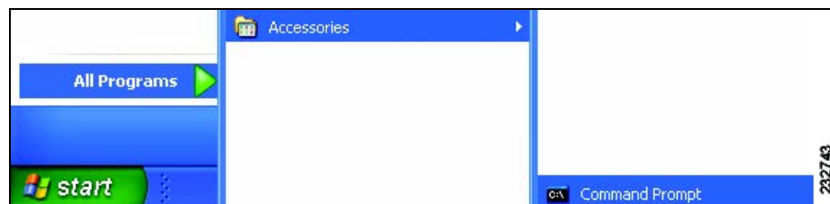
Figure 1 Start > All Programs > Accessories > Command Prompt